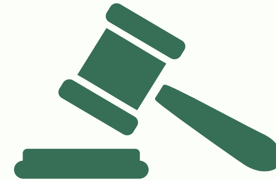
Strategic Litigation Support