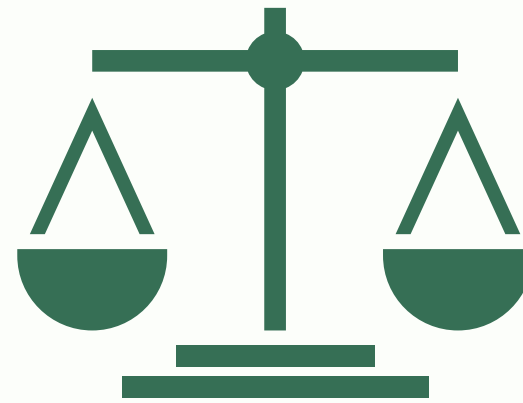
Law Reform Working Groups