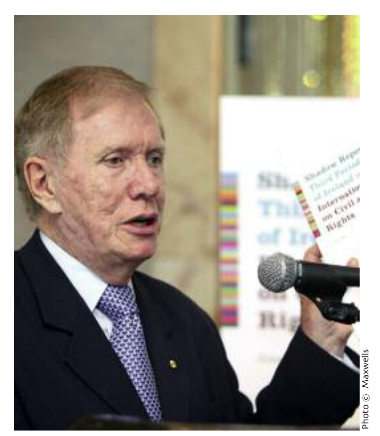
Judge Michael Kirby of the Australian High Court launching the ICCPR Shadow Report See page 8 for details.

n 14-15 July 2008, Ireland's human rights record was reviewed by the UN Human Rights Committee in Geneva under an important international agreement to which Ireland is party, the UN International Covenant on Civil and Political Rights (ICCPR). The Committee questioned Ireland on a wide range of important areas in which the State continues to neglect its obligations on civil and political rights under the Covenant.