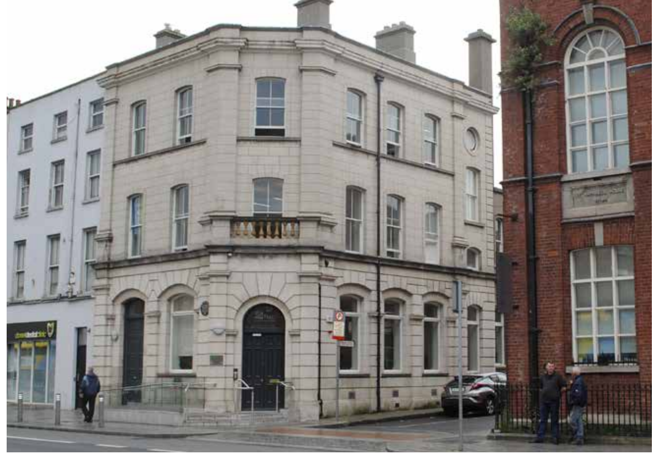
FLAC's Offices at 85/86 Dorset Street Upper.