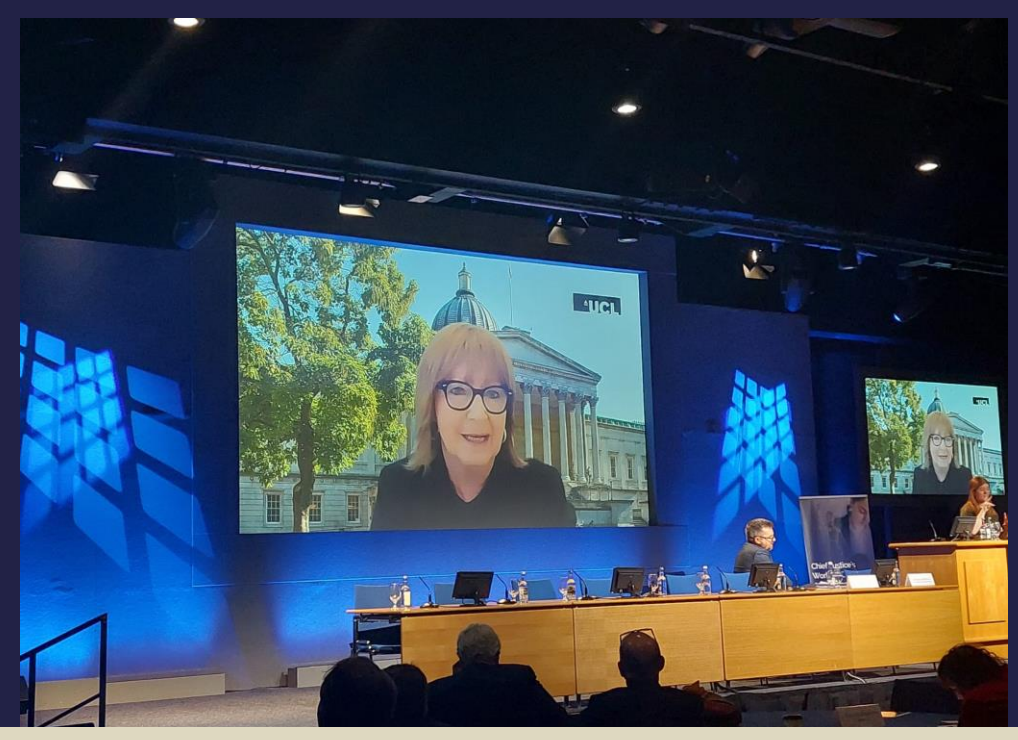
Speakers from the session on "The International Experiences" delivering their presentations remotely,