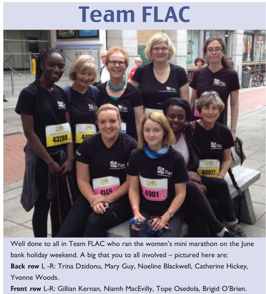
Well done to all in Team FLAC who ran the women's mini marathon on the June bank holiday weekend. A big that you to all involved – pictured here are:

The habitual residence condition (HRC) which is applied to any person seeking a social assistance payment and child benefit, is also being amended in the bill. FLAC's