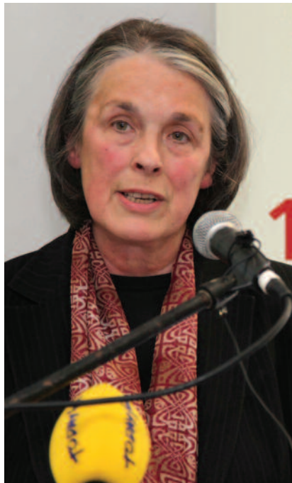
Chief Justice Susan Denham launching FLAC annual report for 2013