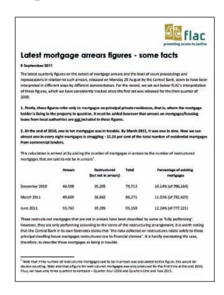
Download FLAC's analysis of the latest mortgage arrrears figures from our website.

Those inclined to minimise the extent of the personal debt crisis would do well to examine these figures a little