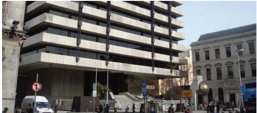
The Central Bank, Dublin.

The publication of this report follows quickly on the heels of the recent decision of Bank of Ireland to introduce more stringent terms for access to its free banking services. Since 21 February, customers have had to keep a quarterly balance of €3000 in their account or lodge €3000 or more during the quarter and have carried out nine online or phone transactions, in order to avoid the imposition of transaction fees. In a press release issued on 17 February, FLAC expressed its concern that the