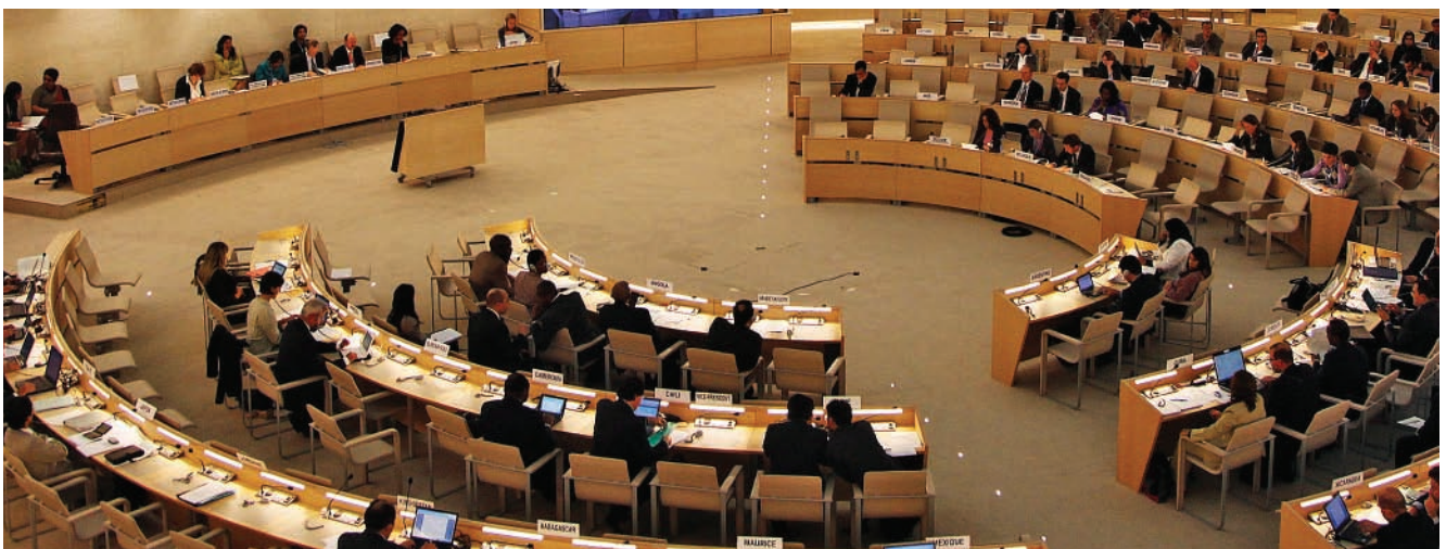
The Human Rights Council in Session

More information on Civil Society’s response to the UPR can be found at: www.rightsnow.ie